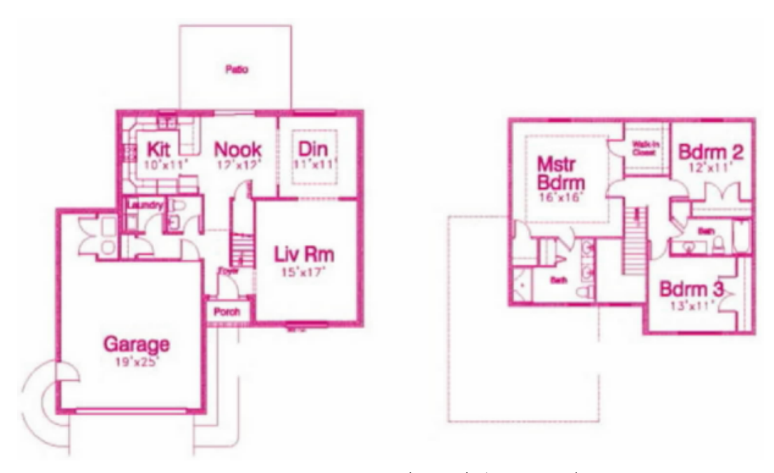
Design Basics's Duncan Plan