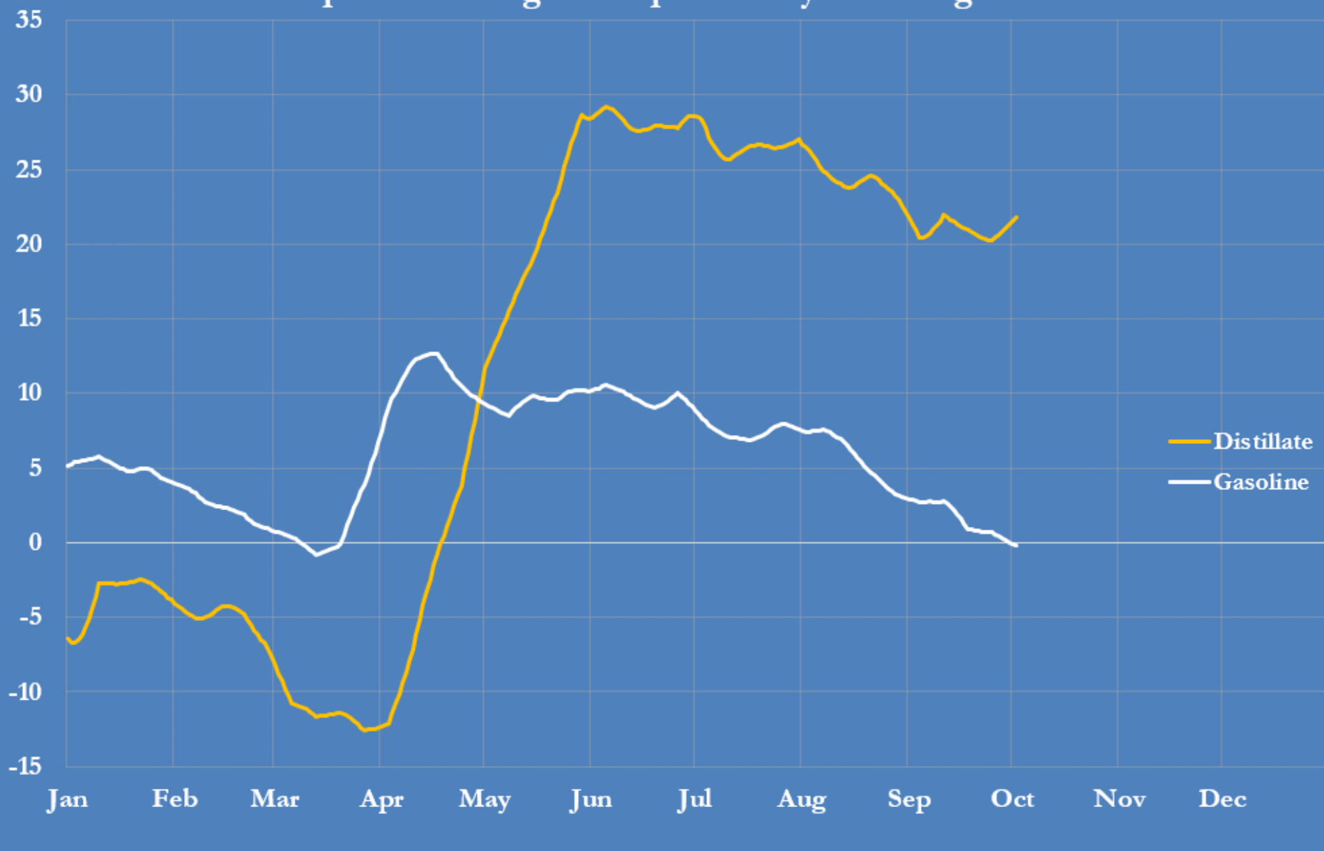
U.S. stocks of gasoline and distillate fuel oil, 2020 percent change from prior five-year average