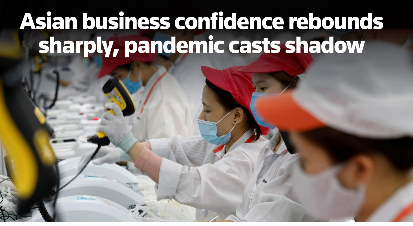
Laborers work at an assembly line to produce ventilators amid the spread of the coronavirus disease (COVID-19) at Vsmart factory of Vingroup outside Hanoi, Vietnam August 3, 2020.