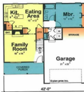
Design Basics' "Womack" (first floor)