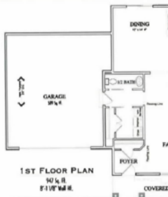
Lexington's "Ashwood" (first floor)