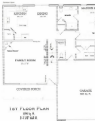
Lexington's "Easton" (first floor)