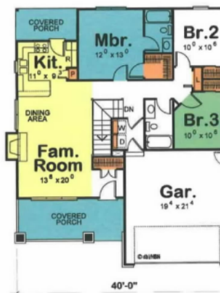
Design Basics' "Kendrick"